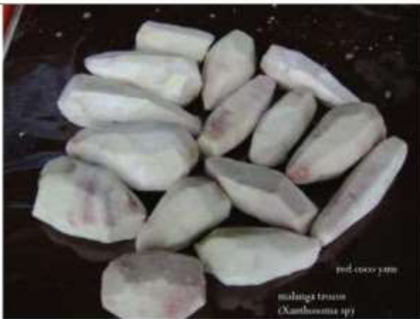
FROZEN MALANGA PIECES