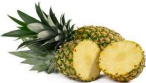
PINEAPPLE ( Ananas sativus )