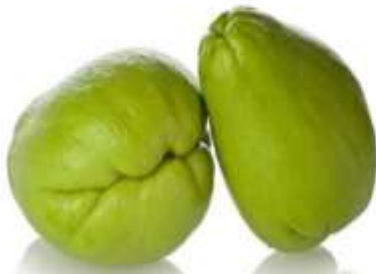
CHAYOTE / TAYOTA ( Sechium edule )