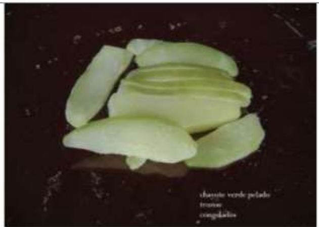
FROZEN CHAYOTE PIECES