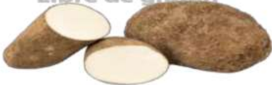
Yam / Ñame ( Dioscorea alata )