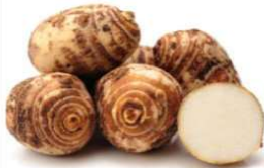
Papa china / Yampi ( Dioscorea trifida )