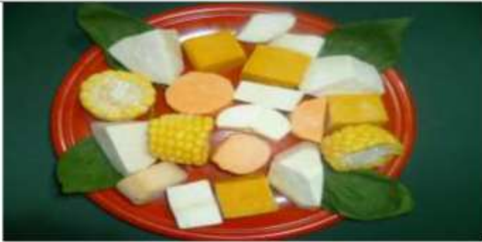
"SANCOCHO" FROZEN MIXED VEGETABLES