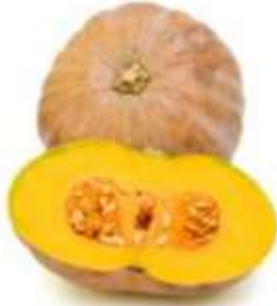
CALABAZA (Cucúrbita pepo)