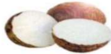
MALANGA COCO (Xanthosoma Spp)