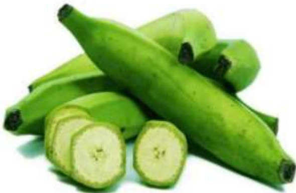
PLATANO VERDE ( Musa x Paradisiaca )