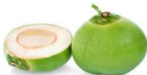
COCO VERDE / PIPA ( Cocos nucifera )