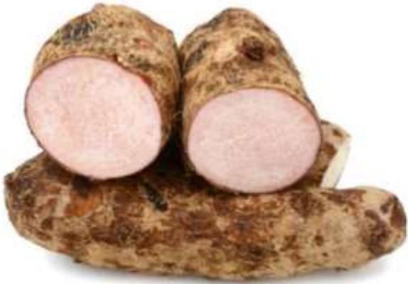
Malanga lila / malanga Lila ( Xanthosoma violaceum )