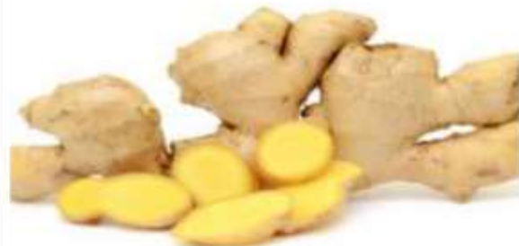
Jengibre / Ginger ( Zingiber officinale )