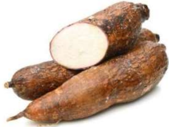
Yuca / Mandioca / Maniho ( Manihot esculenta )