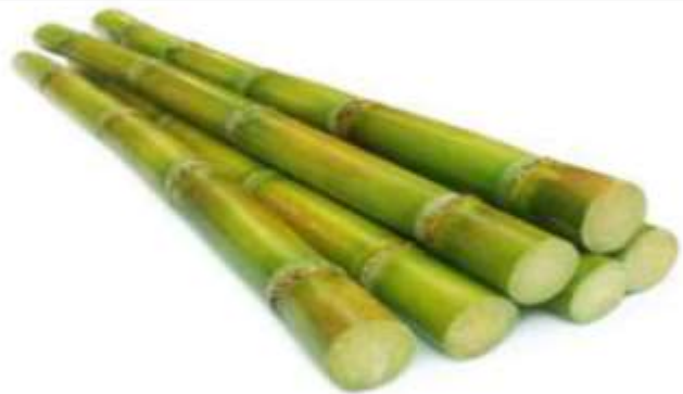
CAÑA DE AZÚCAR ( Saccharum officinarum )